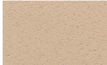
#21 Butternut Base T 200