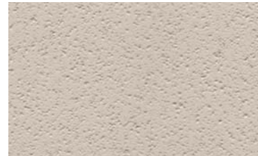
#62 Southern Shadow Base T 200