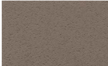
#88 Chestnut Base T 300