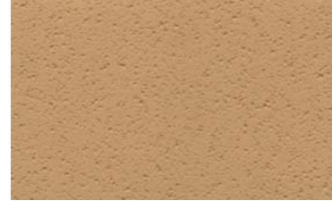
#46 Mystic Gold Base T 200