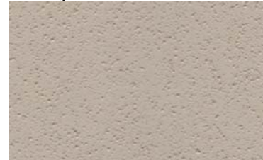
#86 Clay Buff Base T 200