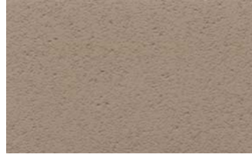
#66 Bear Creek Trail Base T 200