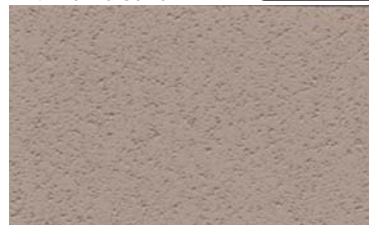
#74 Prairie Sand Base T 300