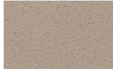
#81 Brushed Leather Base T 300