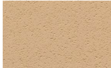
#26 Carmella Base T 200