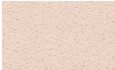
#11 Cashmere Base T 200