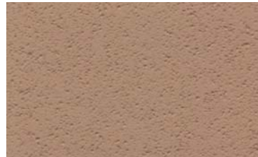
#79 Tuscan Earth Base T 300