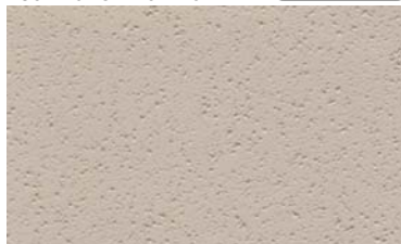
#35 French Vanilla Base T 200