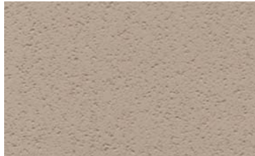
#39 Wheatland Base T 200